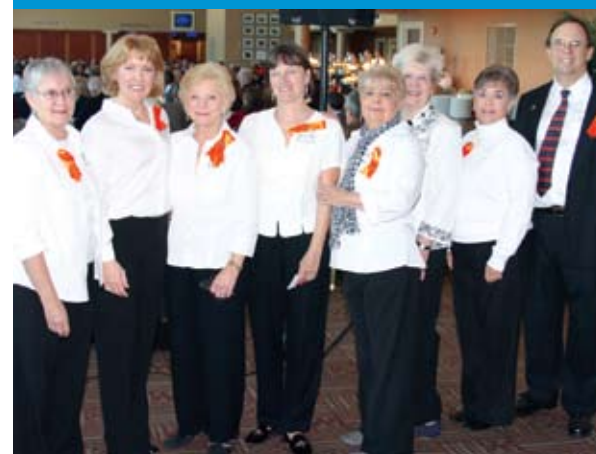
Volunteers from Churchill Downs' Christ Chapel were out in force.